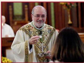
“My flesh for the life of the world.” – John 6:51

Additionally, in the past year Catholic Charities of the Diocese of Fall River established a much needed Mental Health Ministry, providing education and awareness and offering companionship for those affected by mental health issues and their loved ones. As a diocese, we are working to meet a need that has become quite literally, mission critical – reminding those struggling they are never alone. Our donations to the Appeal truly save lives.